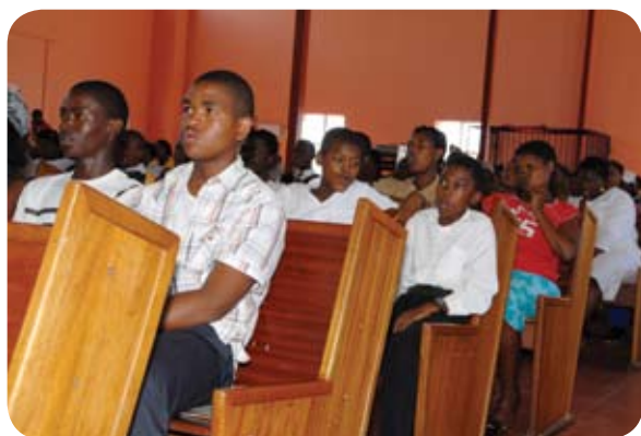
Participants in the Mhluzi dialogue.

Rather than them performing, they should speak about their experiences and they shouldn't make up experiences, they should speak about things that they've experienced because I do believe that if you have experienced something personally you'll make a difference in someone else's life because the very same problem or the very same situation that you are facing, the next person may be