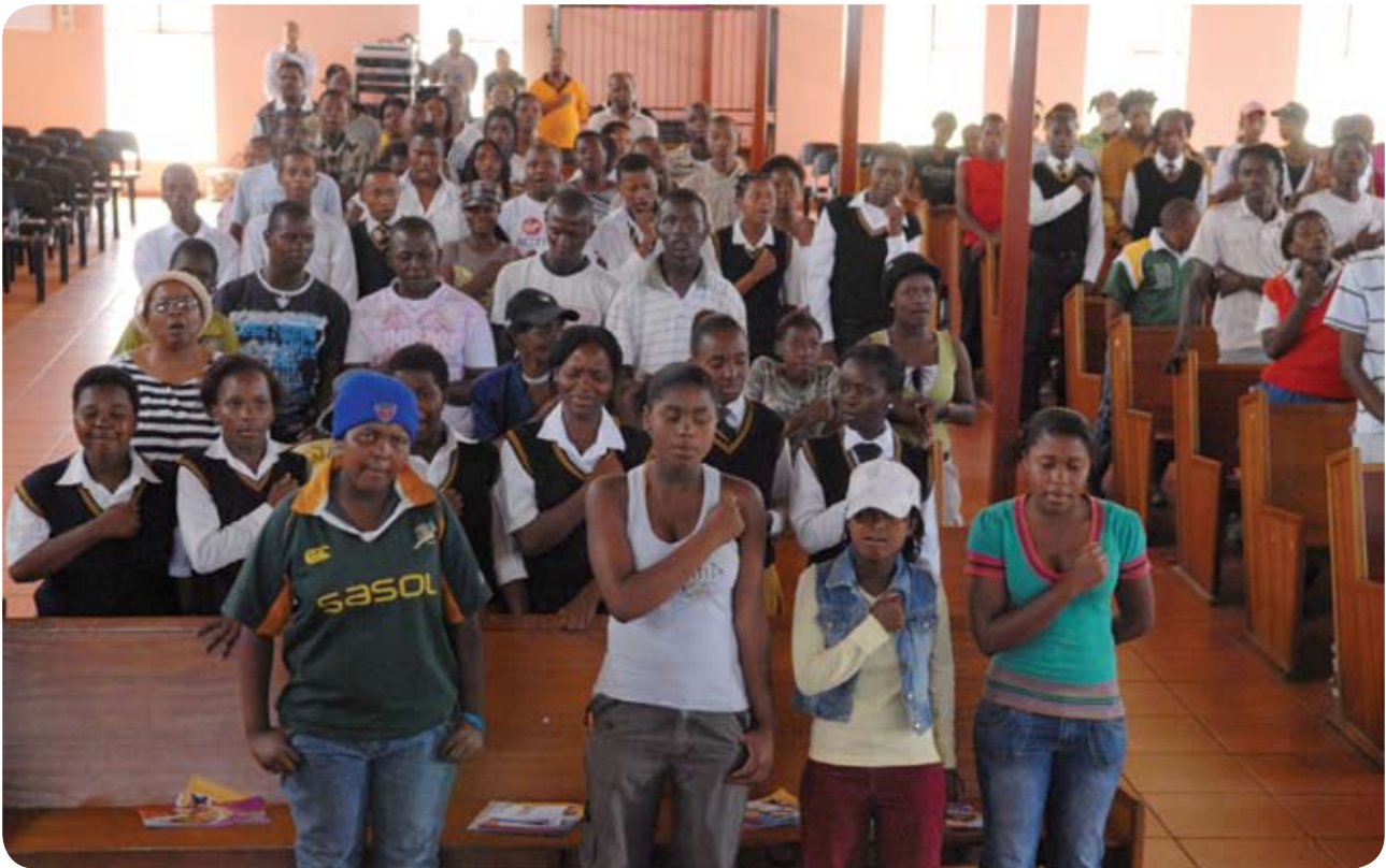
Participants in the Mhluzi dialogue.

of the consequences that will follow. That's why I mentioned a fact that I may booze, I may do everything but is what I'm doing what I planned or what I wanted in my life or is it contributing to what I want to be in future? That's what we should ask ourselves.