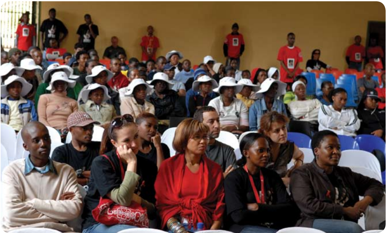
Participants in the Soshanguve dialogue.

HIV / AIDS because there are so many changes happening.