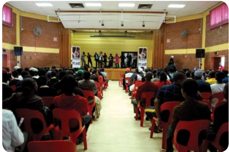
Participants in the Phumelele Community Hall, KwaMakhutha.