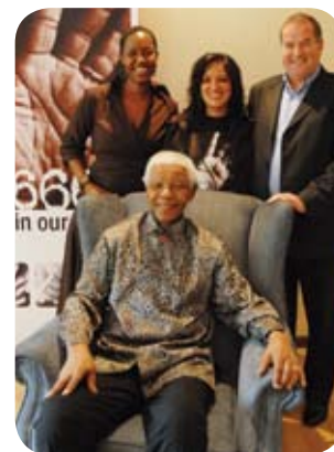
The 46664 team.

Through the Community Dialogues initiative, led by the NMF’s Centre for Dialogue, 46664 plays a vital role in challenging young people to review their knowledge about and attitudes towards HIV/AIDS, and to work together to find effective local responses to deal with the pandemic.