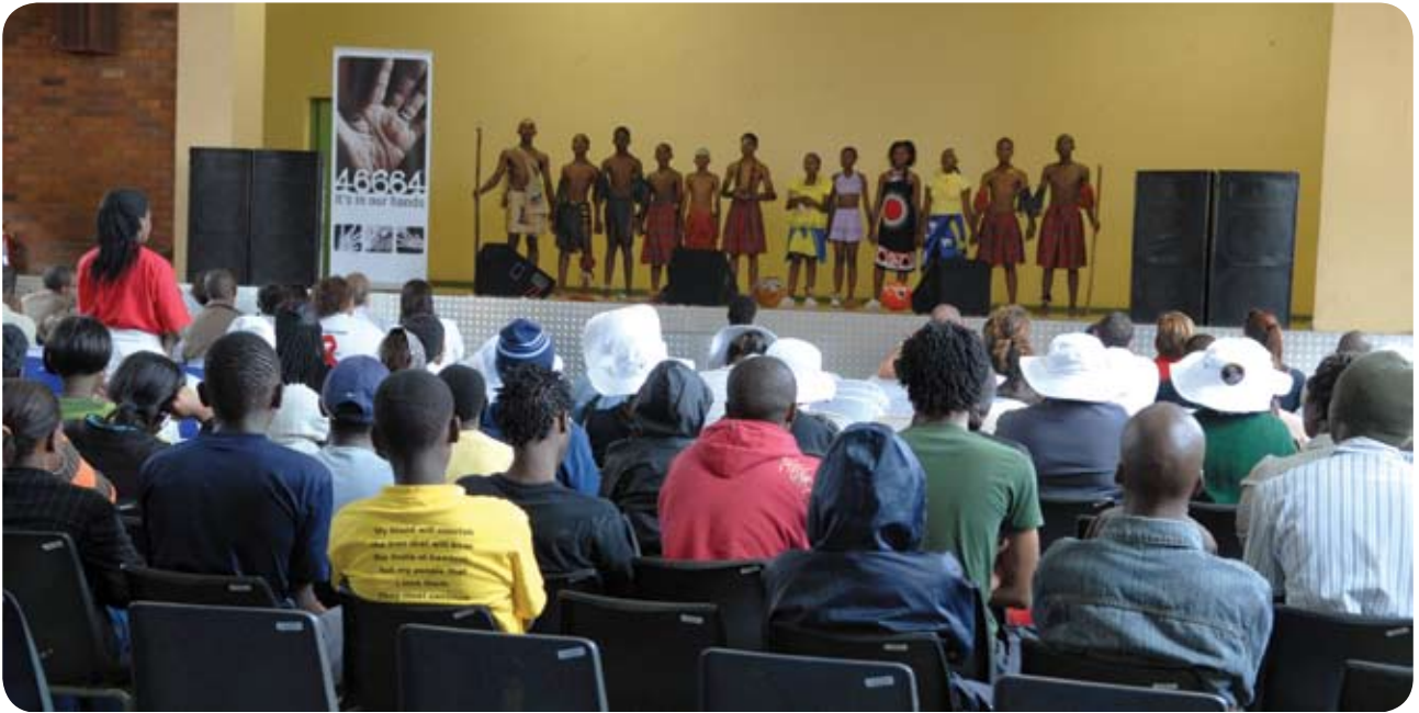
Performance at the Soshanguve dialogue.