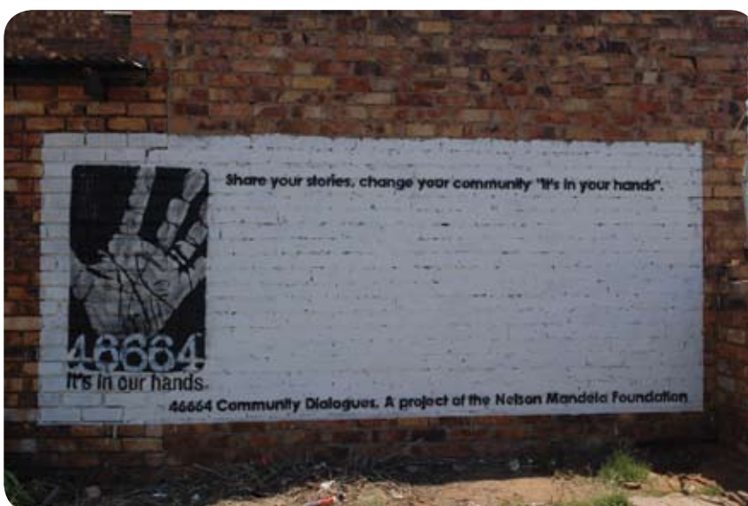
Community dialogue advertising in Mhluzi.

This is a lovely point but you keep saying "you should, you should" – who's "you"?