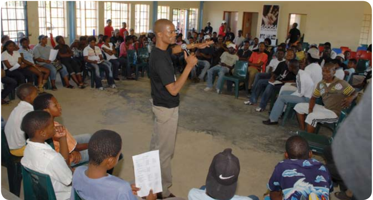
Group discussions in the Lerome Community Hall, Lerome, North West Province.

Y oung people living with HIV and AIDS-affected communities are often overlooked. Projects tend to focus on adults living with HIV.