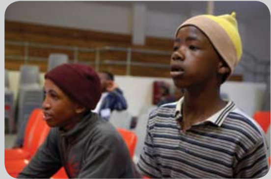
Participants in the Langa dialogue.

An overwhelming majority think the media are doing a good job communicating with young people about HIV/AIDS, and many report personally taking action as a result of what they've learned from radio and TV programmes. Large majorities say that TV and radio are generally doing a good job communicating about HIV/AIDS (96%), and that TV or radio has had a positive impact on their own understanding of HIV/AIDS and related sexual behaviour (89%). Half say they talked with a partner about safer sex, and more than four in ten report that they decided to change their sexual behaviour as a result of what they learned about HIV/AIDS from the media. Nearly a third of sexually active youth say they got tested for HIV as a result of what they learned from a media programme.