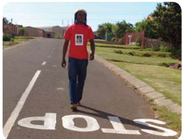
Youth facilitator in Mhluzi.

There are no celebrities, no VIPs at this dialogue event. The VIP area has been taken over by prisoners and wardens from the nearby Witbank correctional services facility. Unshackled and dressed in