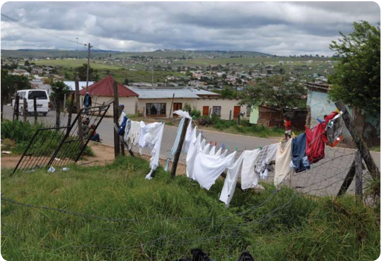
View of Mthatha, Eastern Cape.

can take on these things. We facilitate, saying “You know how to do these things, but we are reminding you that this is the way.” So, we are saying, “In African culture this is how things used to be, we used to sit around under the trees.” That’s why in our dictionaries we have lekgotla and imbizo . These words emanate from our origins and this is where community issues were dealt with, community problems were solved. So let’s go back to basics, “an African solution to a global problem”. We are now making that a practical thing.