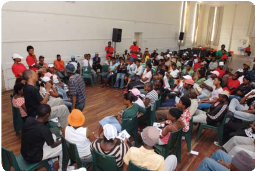
Group discussion in Thaba Nchu.