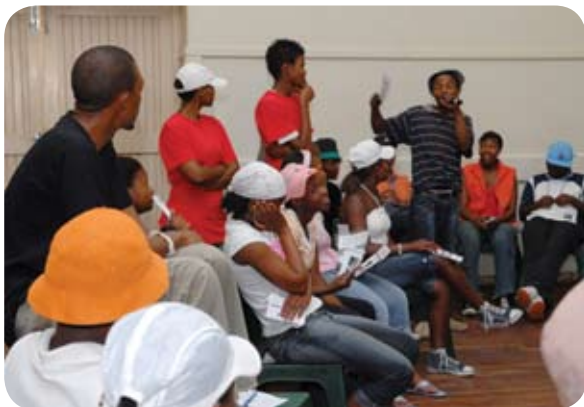
Top: Participants in the Langa dialogue. Above: A member of the community speaks in the Thaba Nchu dialogue.

which addressed real HIV and AIDS issues. This awareness-raising component was located in the mobilisation execution