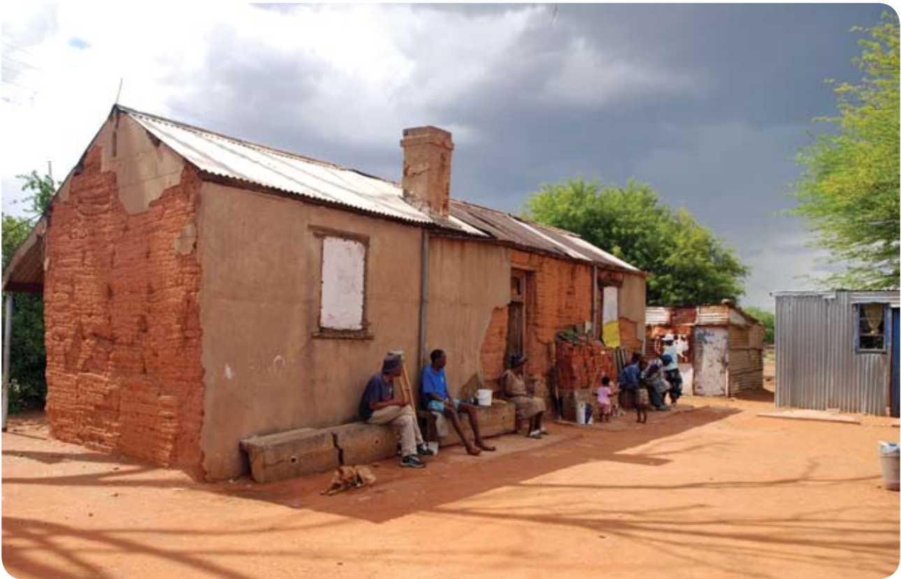
Galeshewe participants came from the surrounding areas.