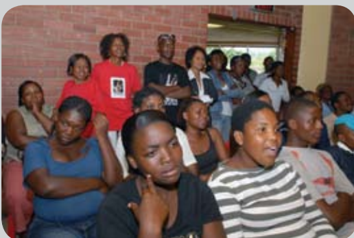
Participants in the KwaMakthutha dialogue.

Young people are in favour of more HIV/AIDS messaging in the media, including messages that are hopeful and inspirational, as well as those that contain straightforward HIV prevention information. Eight in ten agree that there should be more HIV/AIDS messaging and programming on radio and TV, and large majorities agree that messaging should be hopeful and culturally relevant, tap into young people's aspirations, and offer straightforward information about how to prevent HIV. More than six in ten (63%) say that messages about fear and death turn young people off.