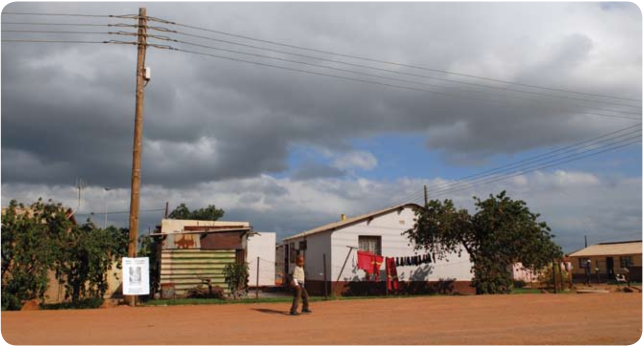
A view of Soshanguve.

skirts, showing your cleavage, dating older guys, dating taxi drivers and everything. You are yourself because of you, your confidence, the way you are, the way God made you.