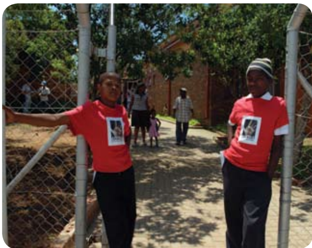
Youth facilitators in Mhluzi.

Nkosi says Lerome's youth is focused on issues around "aspiration", specifically youth who have transactional sex with men who work in the mines. "The guy is going out with six other girls in the community, but because you can buy me nice shoes and nice clothing, I don't mind ... But these guys also have the power to say, 'why would you want me to wear a condom, don't you trust me?' You could imagine with older people, they don't believe in using condoms."