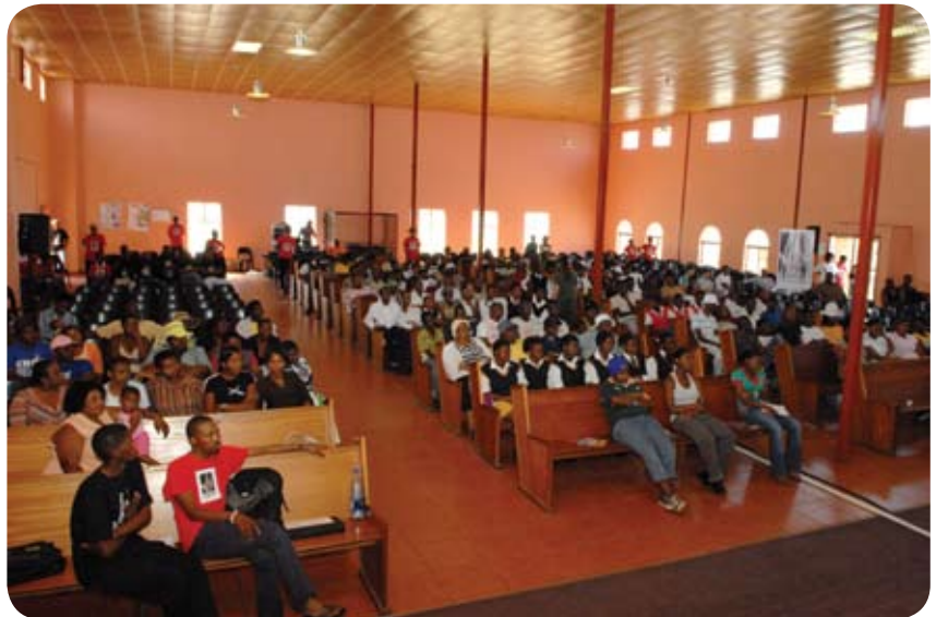
St Peter's Lutheran Church, Mhluzi.