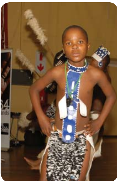
One of the dancers at the KwaMakhutha dialogue.

KwaMakhutha. Stories on all events were covered by all local newspapers.