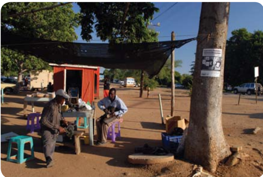
View of Giyani.