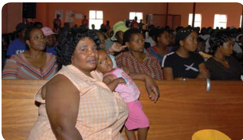
St Peter's Lutheran Church, Mhluzi.