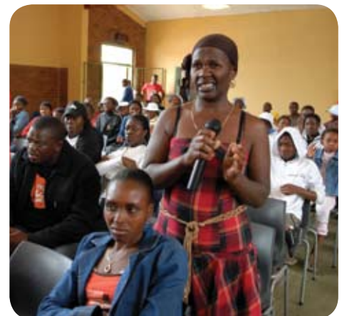
Soshanguve dialogue session.