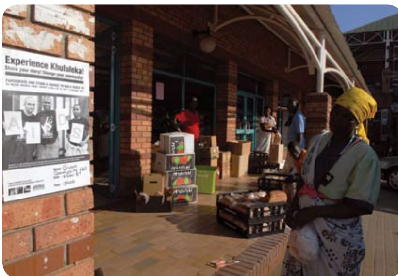
Top: Discussions at the Giyani dialogue.