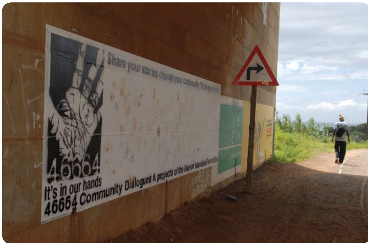
The 46664 mural in KwaMakhutha.

Social mobilisation amplified through media will remain an integral part of the overall communication strategy for the dialogue campaign and other related African HIV and AIDS initiatives.