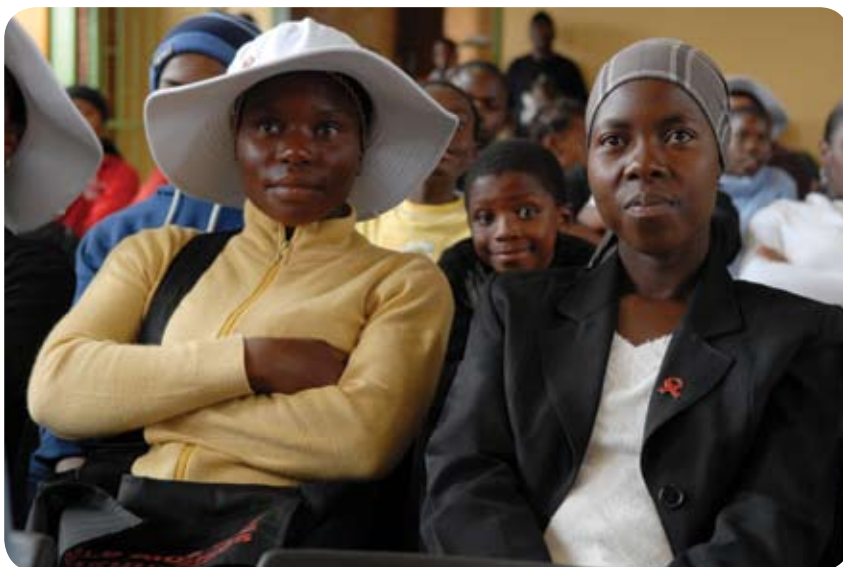
Participants in the Soshanguve dialogue.

It would be easier than having the government spending a lot of money on festivals. When top artists have been booked they don't come for free, they want money. Take that money and invest it in