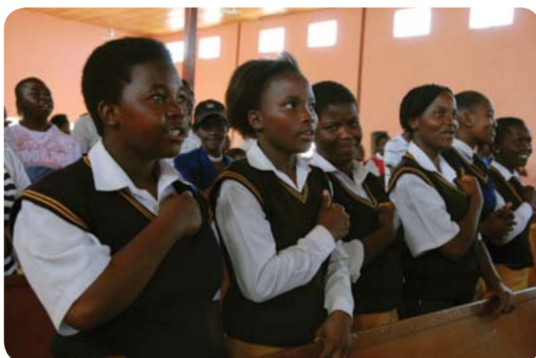
Schoolchildren attending the dialogue in Mhluzi, Mpumalanga.