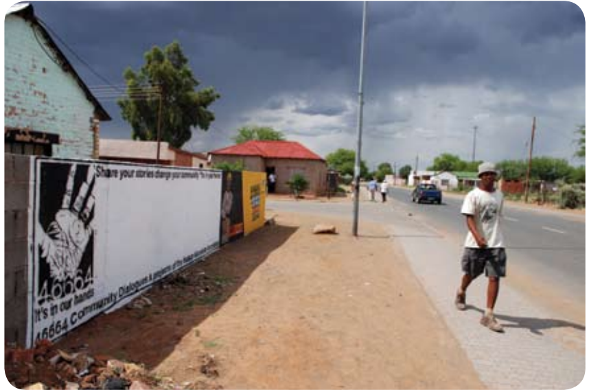
Mural in Galeshewe.