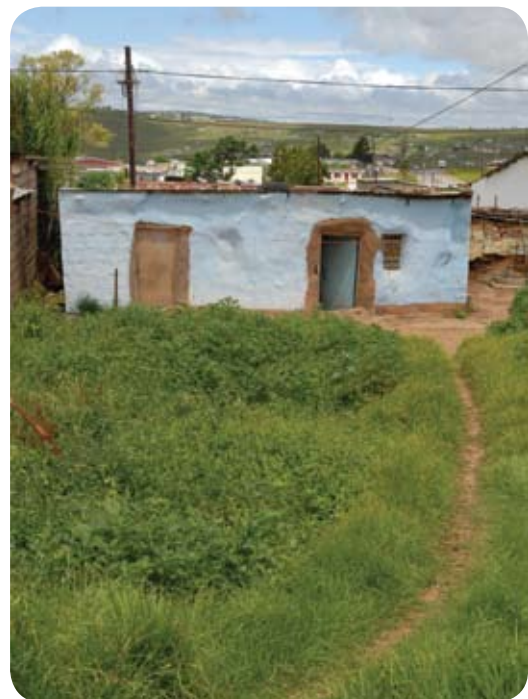
Ngangelizwe Township, Mthatha.