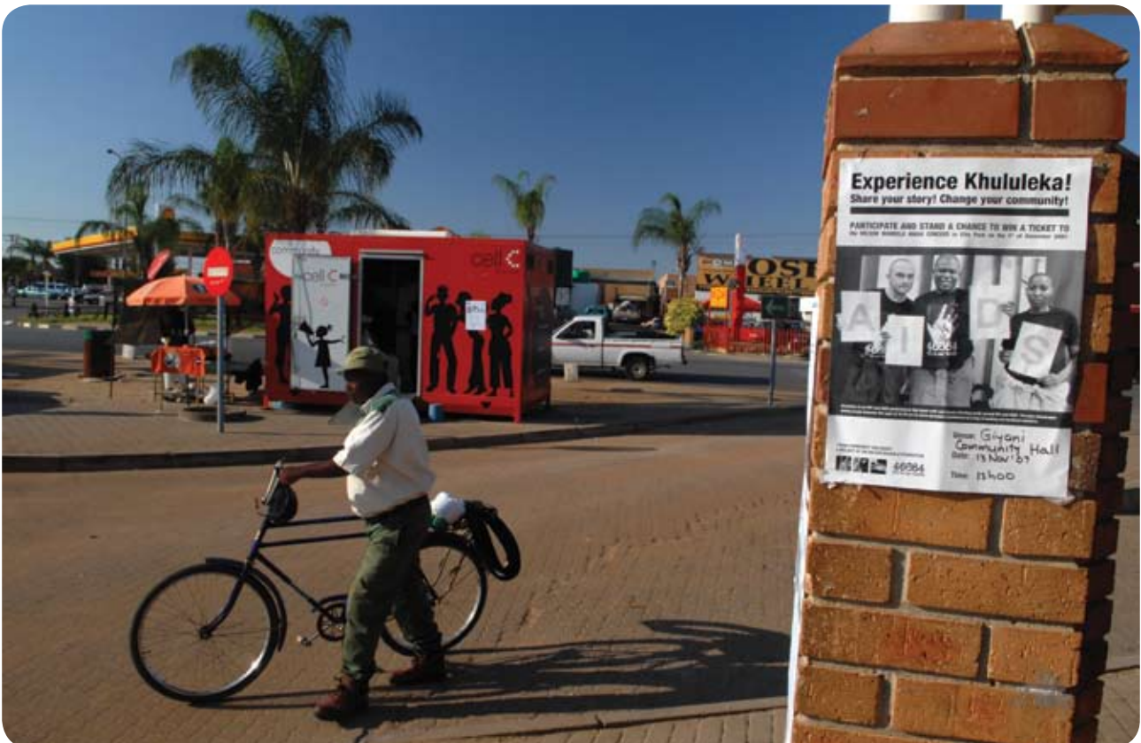
A view of Giyani, Limpopo Province.

recommendations and/or declarations on public murals after each dialogue. The murals depict the 46664 “It’s in your hands” emblem and serve as a continuous reminder to the local youth about their commitments. The dialogues have provided the Nelson Mandela Foundation with experiences and insights from young people and will be drawn on in future initiatives.