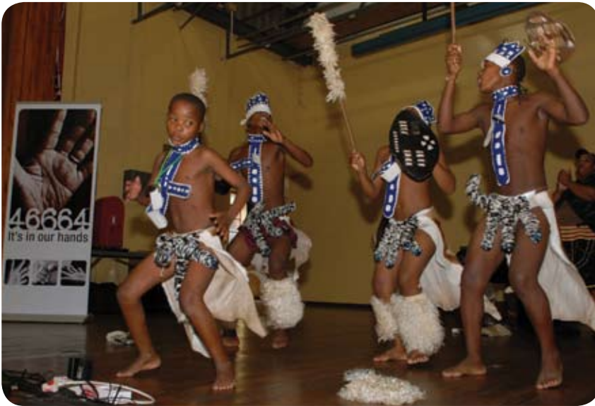
The cultural performance at the KwaMakhutha dialogue.

workshopped; it was different to what it is now. We saw what works and what doesn't and then we reshaped it and I think we're quite happy with the product as it is now. And it might still change, it might still evolve.