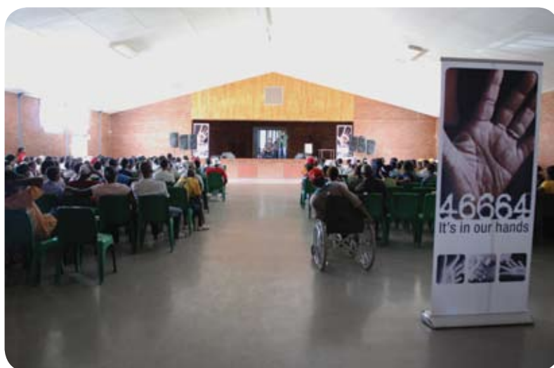
Community dialogue in Galeshewe, Northern Cape.