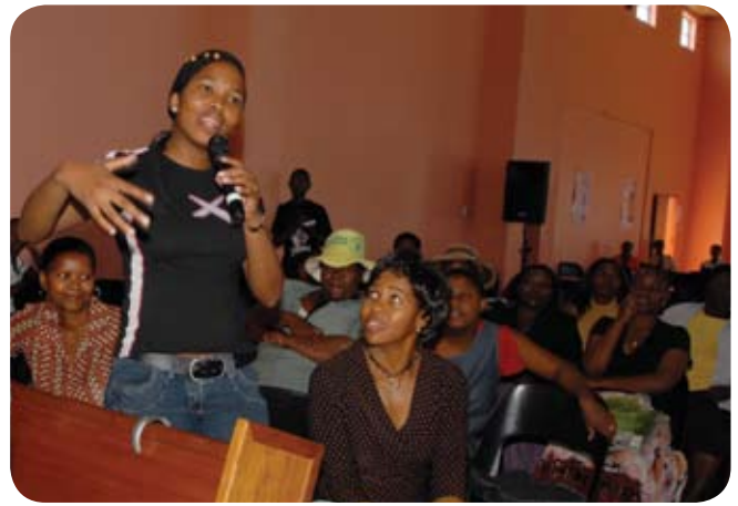
An audience member participates in the Mhluzi dialogue.

You guys, most of the time there's a lot we can do but what we do is sit at the street corners. We smoke, a mother walks by and you trip them and take their money; when you think about it, this person was just making a life for their kids, they are a parent, isn't it? So what is good in that? Let's stop this not using our brains. This person