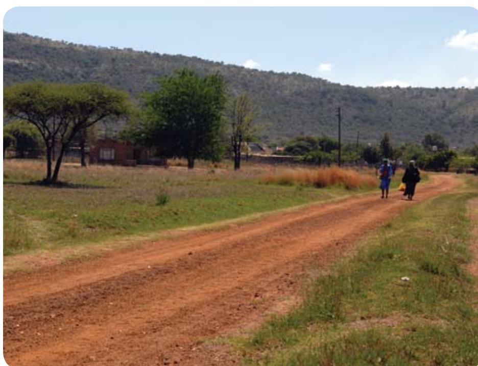
View of Lerome, North West Province.