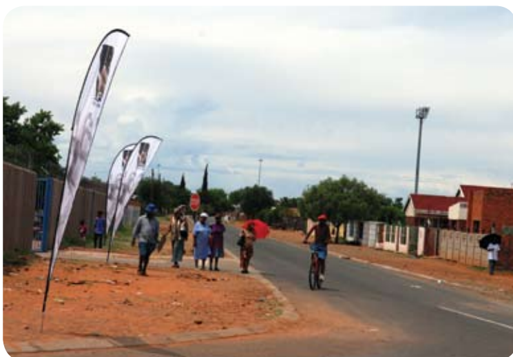
The community of Galeshewe.

◇ The elders should also stop pointing fingers at young people; they need to take their place and start guiding young people in life. They should stop considering sex talk taboo because whether or not they want to admit it, young people are having sex.