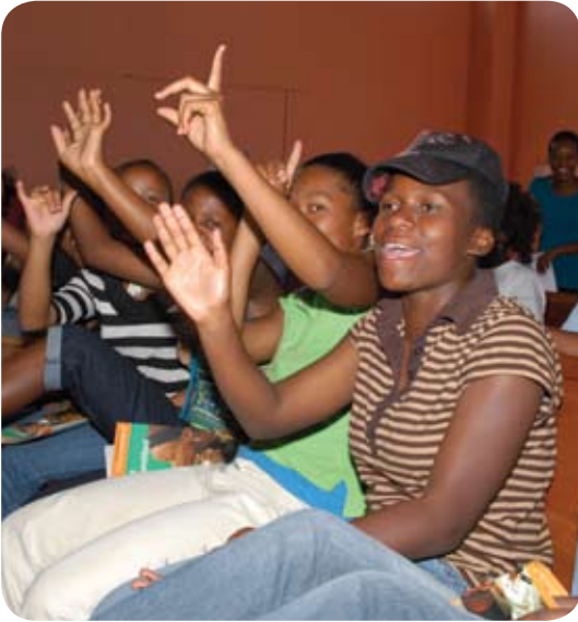
Participants in the Mhluzi dialogue.