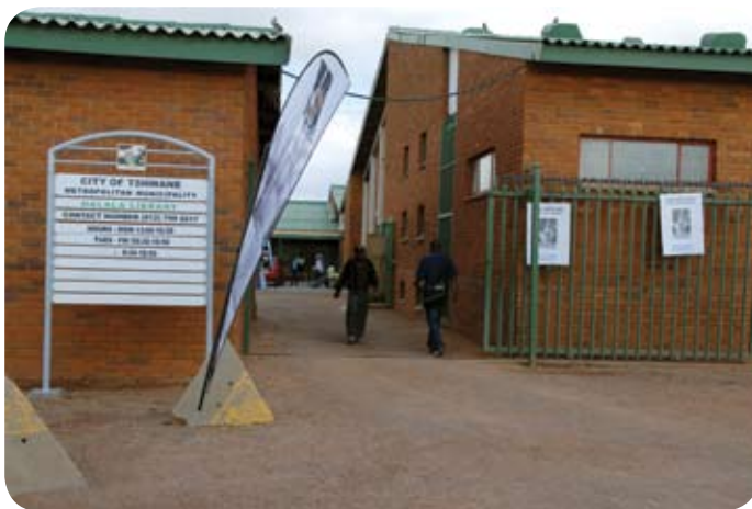
The Galala Community Hall, Soshanguve.