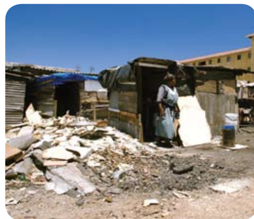
Langa, Western Cape.