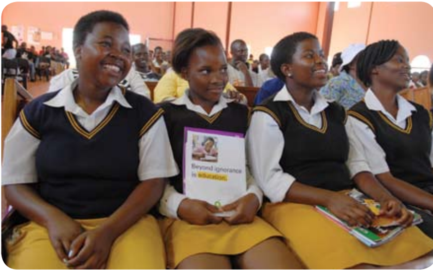
Schoolchildren attending the Mhluzi dialogue.

matching suits, they've been invited to share their stories with the youth. There are rumours that the premier may arrive, but there's no waiting for dignitaries. The event begins at 1pm, on time.