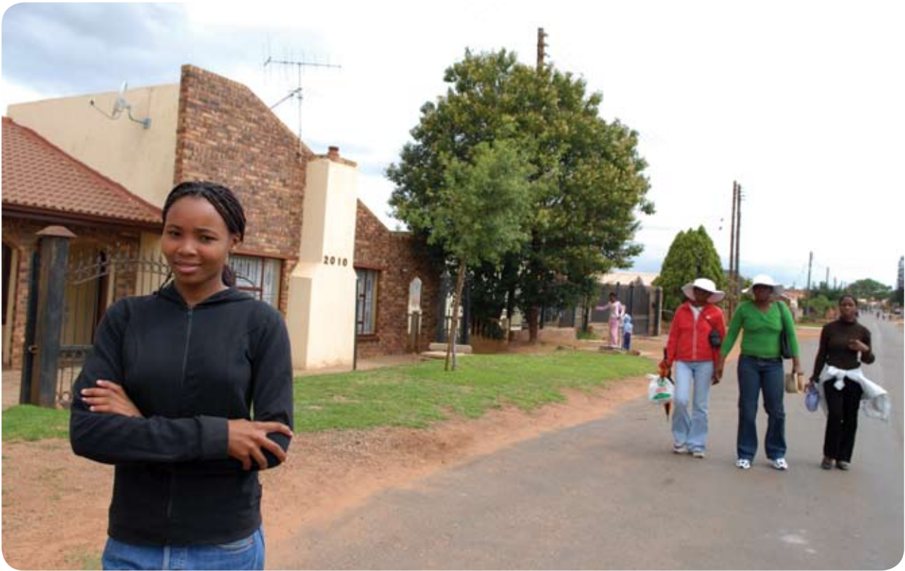
Youth in Soshanguve, Gauteng.

education so that we can have more knowledge.