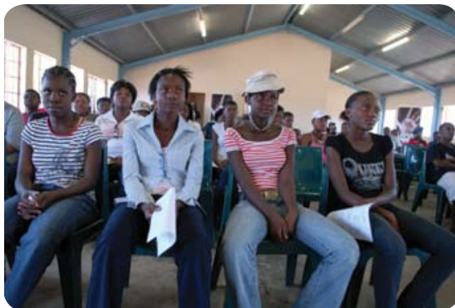
Dialogue participants in Lerome.

loveLife is a South African HIV prevention programme for young people; groundbreakers are the organisation’s workers implementing HIV/AIDS and lifestyle education programmes.