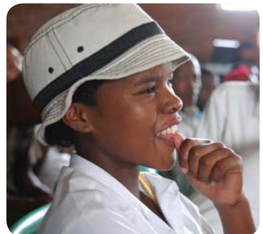
Participant in the Galeshewe dialogue.