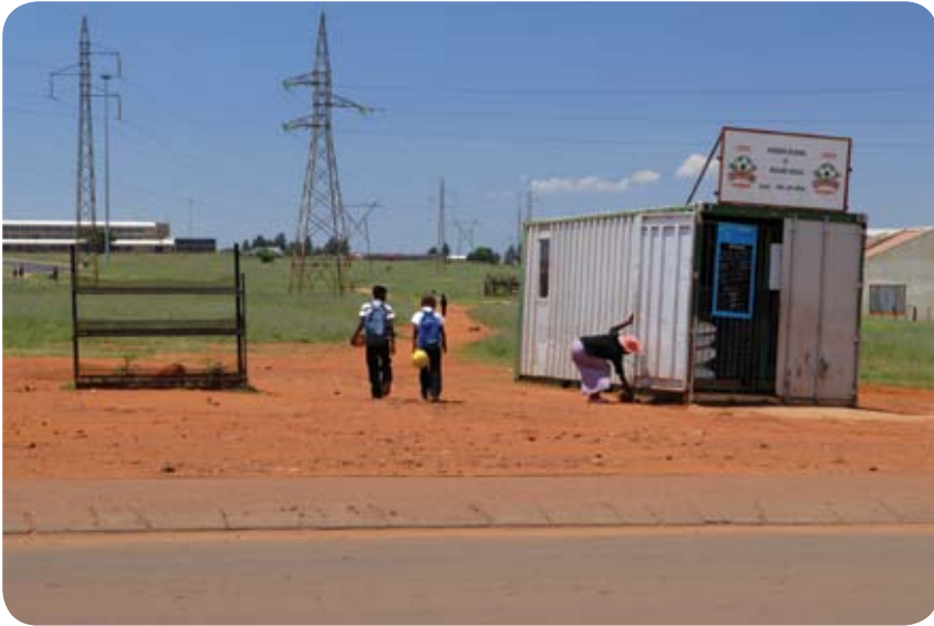
View of Lerome.