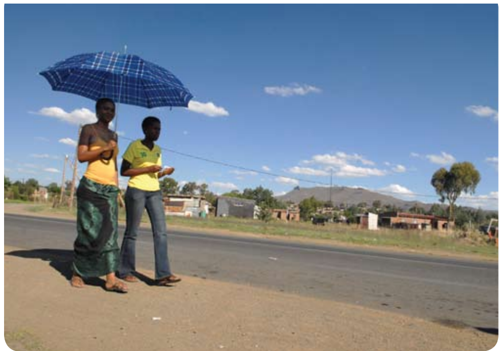
A view of Thaba Nchu.

The community dialogue session was facilitated by Lesley Nkosi. In the initial stages of the dialogue session, it seemed as if people had been instructed not to talk. After a few ice-breakers, the floor was opened to comments and questions. The youth said that young girls deliberately fall pregnant in order to access the R400 a month child-care