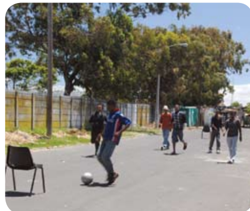
Langa, Western Cape.